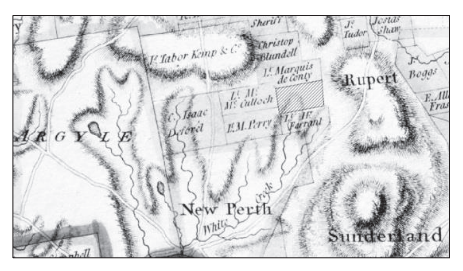
Detail from Sautier's 1779 map, with cross-hatching added to show the location of the patent that included the grant to Donald McIntyre (near the center of the upper right quadrant). <sup>18</sup>

The explanation for the discrepant placenames in Daniel McIntyre's petitions is that the land, which prior to 1763 had been under French control and not amenable to British settlement, was afterwards attractive enough to become