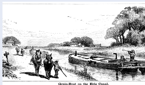
Grain-Boat on the Erie Canal.